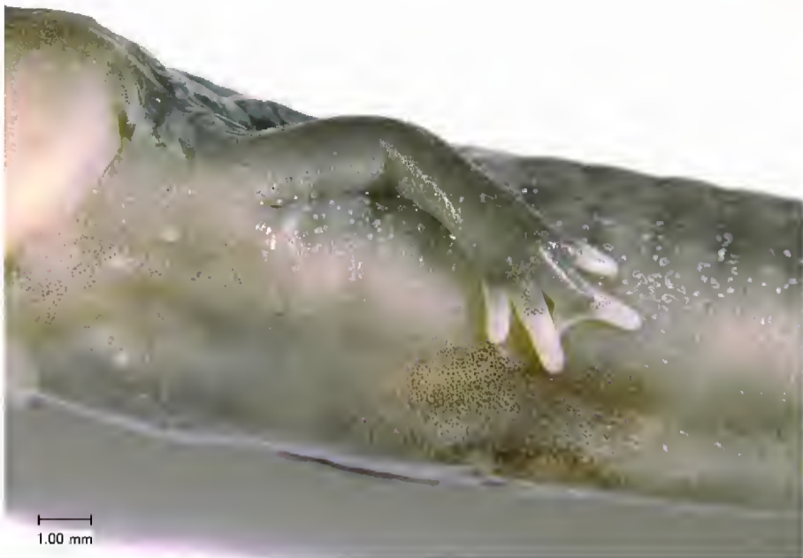
Fig. 5. Metamorph of Tylotriton zieglerei at stage 44, with an additional finger on left hand, collected in Ha Giang Province in 2012 and preserved in ethanol.

body ( F_{1,50} = 5.32 , P < 0.01 ). Clutches of T. zieglerei were between 10 and 100 cm away from water (mean 50 \pm 28 cm, n = 11 ), while the ones from T. vietnamensis were found at a distance between 17 and 188 cm (mean 80 \pm 41 cm, n = 41 ) from the water.